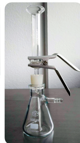
Microplastic Sampling Kit (PN A165-MP) consisting a set of a complete filtration equipment and aluminium oxide filters.