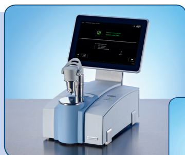
ALPHA II FT-IR spectrometer and BRAVO Handheld Raman spectrometer