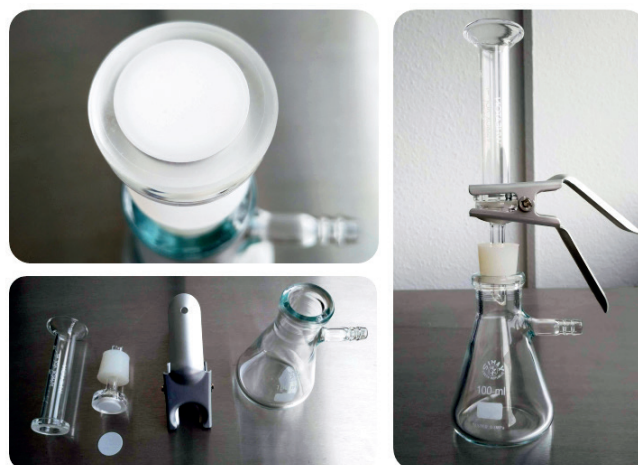
Microplastic Sampling Kit (PN A165-MP) consisting a set of a complete filtration equipment and aluminium oxide filters.

Within minutes, it provides a full list of found particles, their identity, size, quantity and spatial distribution across the filter. In short, this software makes your analysis more robust and the results more precise and reliable. All while being faster. A lot faster.