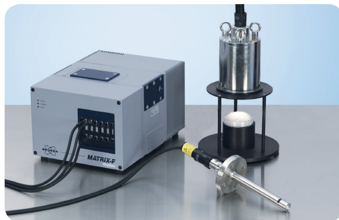
FT-NIR Process Spectrometer MATRIX-F with Probe an sensor head

Modern control software hands the data over to the process control system and if the product is running out of specification, it will be detected within seconds and corrective measures can be carried out. With the classical off-line analysis, several hours can pass before the sample