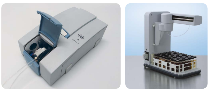
Figure 1: ALPHA II FTIR spectrometer (left) equipped for oil analysis and autosampler AIM3300 (right) prepared for measurement.

Therefore, the ASTM adopted a standard practice E2412 titled; "Standard Practice for Condition Monitoring of Used Lubricants by Trend Analysis Using Fourier-Transform Infrared (FTIR) Spectrometry" illustrating the increased application of FTIR spectroscopy in this field.