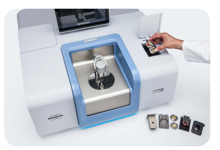
Figure 4: INVENIO FTIR plattform offers higher sensitivity and many productivity tools to enhance routine analysis tasks. A special feature is the transit channel, a second sample compartement.

Infrared spectrometers come in various shapes and configurations and Bruker even offers a dedicated used oil analysis kit.